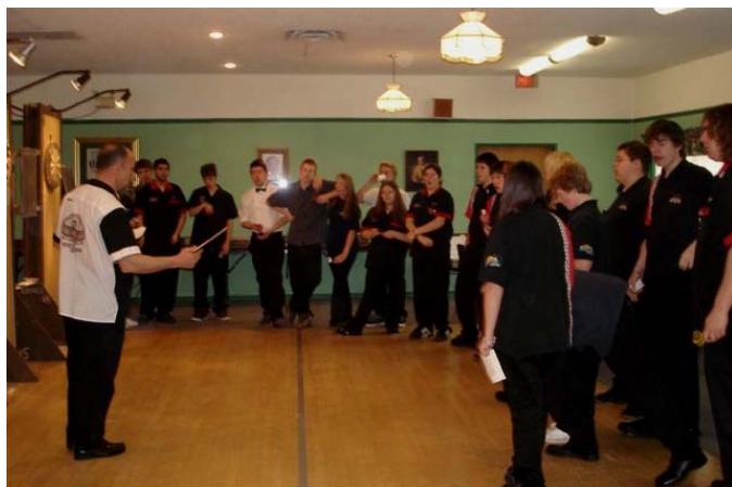
2007 B.C. PROVINCIAL YOUTH PLAYDOWNS

Sections will be at the discretion of the BCDA Youth Director & Provincial Coaches.